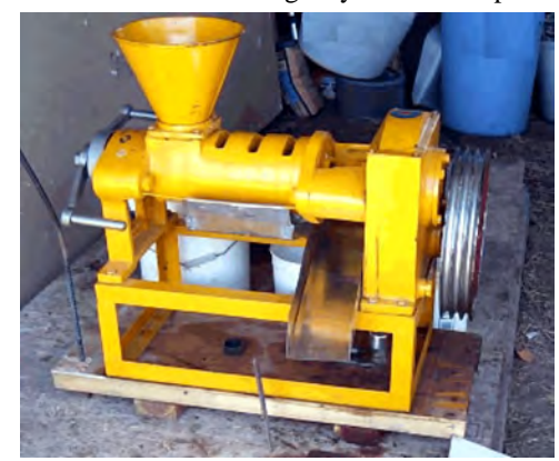
Fig. 2: The one-ton press oil expeller (Anyang GEMCO China)