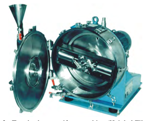
Fig. 3: Two-beaker centrifuge machine (Heinkel Filtering Systems, Inc. USA)

In most small-scale rural situations, this is of little or no importance as the cake that remains after the oil has been removed finds uses in local dishes, in the manufacture of secondary products or for animal feed. Some raw materials however do not release oil by simple expelling; the most notable being rice bran. To remove oil from commodities