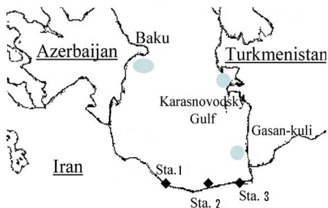
Fig. 1: Sampling locations of fishes in Caspian Sea

background corrector was used for the determination of heavy metals, lead, chromium and cadmium concentrations were determined by a graphite furnace atomic absorption spectrophotometer 110 employing pyrolytic platform graphite tubes. Hydride generation was with a Varian model 77 with quartz tubes.