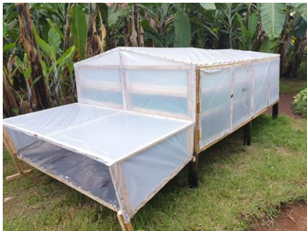
Figure 1. Direct mode dryer with wooden shelves and polythene cover

Researchers at Tanta University (Egypt) developed an indirect-mode solar dryer with two collectors. The first collector is an aluminium absorption plate. The second one is also an aluminium plate with sand at the bottom side of the absorber plate [18]. The experimental results showed that the heat stored during the day provides the heat needed for overnight drying. The use of sand as a heat storage material was also reported to have shown no significant increase in thermal efficiency. An attempt was also made to improve the effectiveness of an indirect-mode dryer with evacuated tubes for energy collection and sensitive storage [19]. Gravels are used as sensible heat storage materials and these gravels absorb the heat from a hot air stream which comes from the evacuated tubes and release the heat during the off-sunshine hours. Experimental results indicate that the use of heat storage