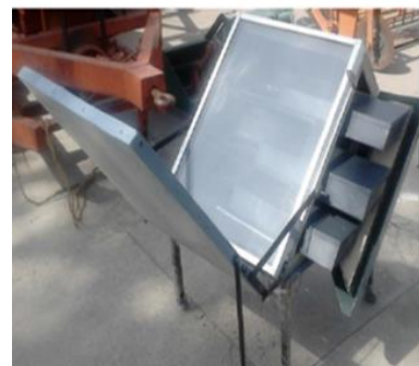
Figure 2. Solar dryer and cooker