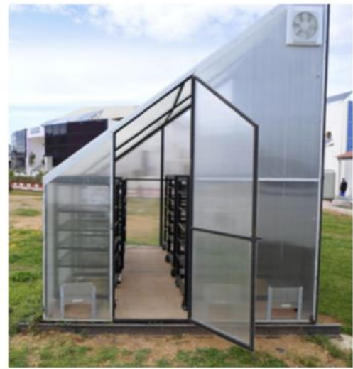
Figure 3. Tunnel type dryer

A numerical investigation was conducted on the solar greenhouse dryer for the drying copra [53] and the model used during the analysis. Compaq Visual FORTRAN version 6.5 software was used for the analysis. It was observed that the air temperature inside the greenhouse was higher than the ambient temperature throughout the