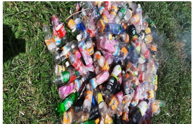
Figure 6. Plastic containers segregated in Equity girls' hostel blocks