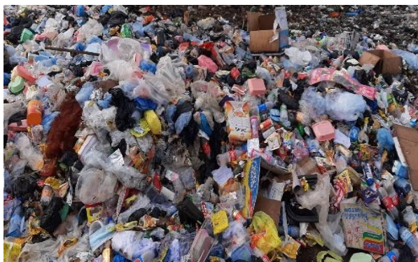
Figure 2. Dumping site of generated waste

Rooms in each block of equity girls hostels were identified and the total number of rooms in each block being occupied by students is 41. Therefore, for the three blocks, the total number of rooms is 123.