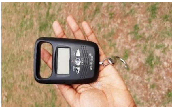
Figure 3. Automatic weighing balance