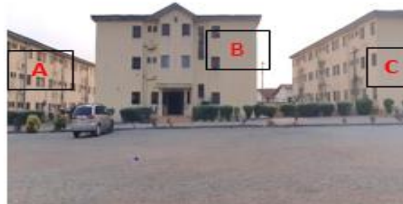
Figure 1. Front view of Equity girls' hostels in Crown Estate Campus, Igbinedion University Okada

Equity hostels are girls' hostels located in the residential crown estate, Igbinedion University Okada, Edo State Nigeria. The hostels are mainly for students from 200L to 500L of all disciplines in the University. Some commercial stores such as restaurants, hair salons, barbers shops, etc, are located within the hostels' premises. They perform commercial activities including the selling of essential commodities, goods, and services needed for the well-being of students which invariably contribute to the volume of wastes generated in the study area. Figure 1 is the front view of Equity girls' hostels in Igbinedion University Okada. Equity girls' hostels have three structural buildings which are named block A, block B, and block C as shown in Figure 1. Each of the hostel (block) has a total of 42 rooms. Therefore, the total number of rooms for all the blocks summed up to 126 rooms. The total number of rooms occupied by students is 123 rooms while the remaining 3 rooms serve as porters/administration offices. No of residents in each room is a maximum of 3 students and a minimum of 2