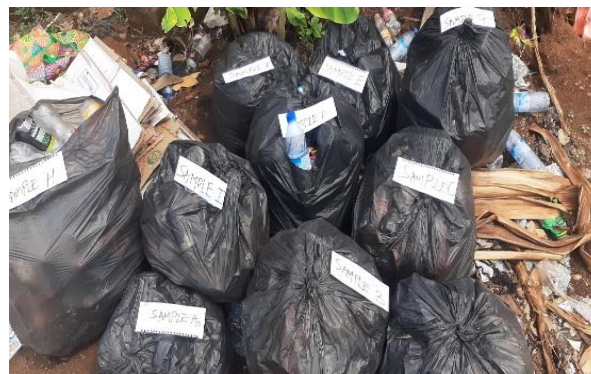
Figure 4. Segregated wastes packed in polyethylene bags

Waste generation rate for each student/resident of Equity girls hostel blocks was calculated using the total amount of waste collected for 3 months estimated as 90 days and the population count estimated in the blocks/premises as described in Equation (1):